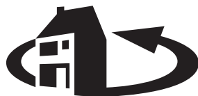
Draaiend Huis – art work on a roundabout