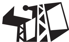
Den Ophef – modern sturdy bridge