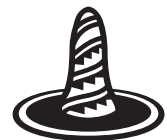
fallusrotonde – artwork on a roundabout by Marius Boenders