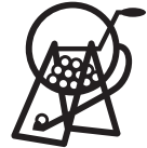
bingo – popular game