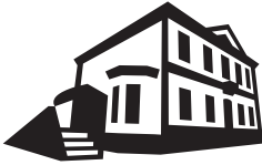
NWE Vorst – theatre for experimental performances