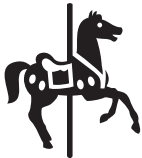
kermis – the biggest fair in the Netherlands