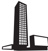
Westpoint – highest building in Tilburg