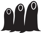
Zusters in staal – art work remembering the Sisters of Charity