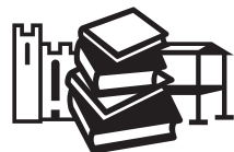
Boeken rond het Paleis – annual antiquarian book market