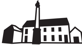
Duvelhok – former textile factory, now a social business complex