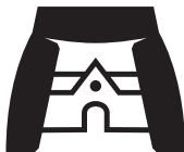
Carré – former hospital with artwork by Niko de Wit