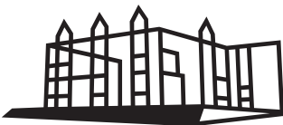
Moerenburg – art work symbolizing a former manor