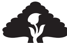
lindeboom – the late linden tree on the main square