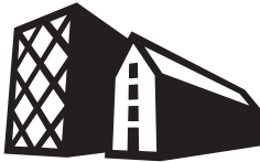
Textielmuseum – museum about the former Tilburg textile industry