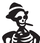
Piet Stams – famous Tilburg character (1851–1914)