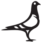
dèuf – slang word for 'pigeon'