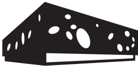
T-kwadrat – modern sports building