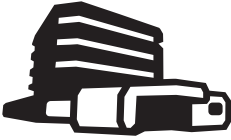
het blauwe gebouw – ‘the blue building’, characteristic office building