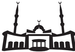
moskee – notable mosque