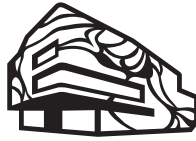
Drieburcht – sports complex