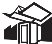
De Pont – museum of modern art