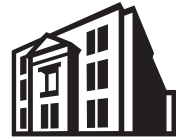
Natuurmuseum – educational museum about nature