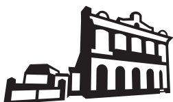
Cinecitta – oldest cinema in the Netherlands, established in 1916