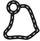
ringbaan – the ring road of Tilburg