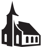
Hasseltse kapel – oldest religious building in Tilburg