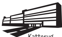
Katterug – apartment complex called ‘The Cat’s Back’

In 2017 new icons were drawn and incorporated in TilburgsAnslcons. This font contains ninety icons in total. Below you find the new icons as well as a short description.