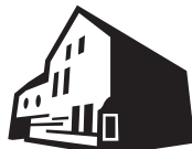
Paradox – renowned jazz stage