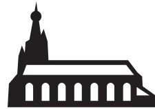
Heikese kerk – the oldest church in Tilburg