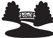
Wilhelminapark – park established in 1898