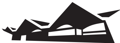
kroepoekdak – prawn cracked roof of Tilburg central station