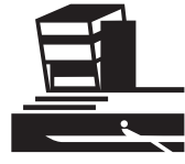
kenaol – dialect word for the Wilhelmina canal