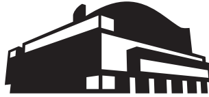
Concertzaal – concert hall