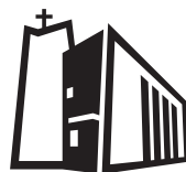
OLV ter Nood – chapel for the Madonna