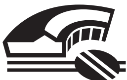
polygonale hal – former train repair building