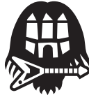
Roadburn – festival for psychedelic rock