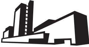
Interpolis – characteristic insurance company building